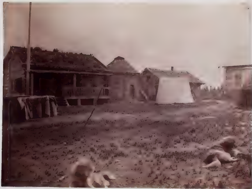
| 27. Kolmakovsky, showing old Russian Fort. |